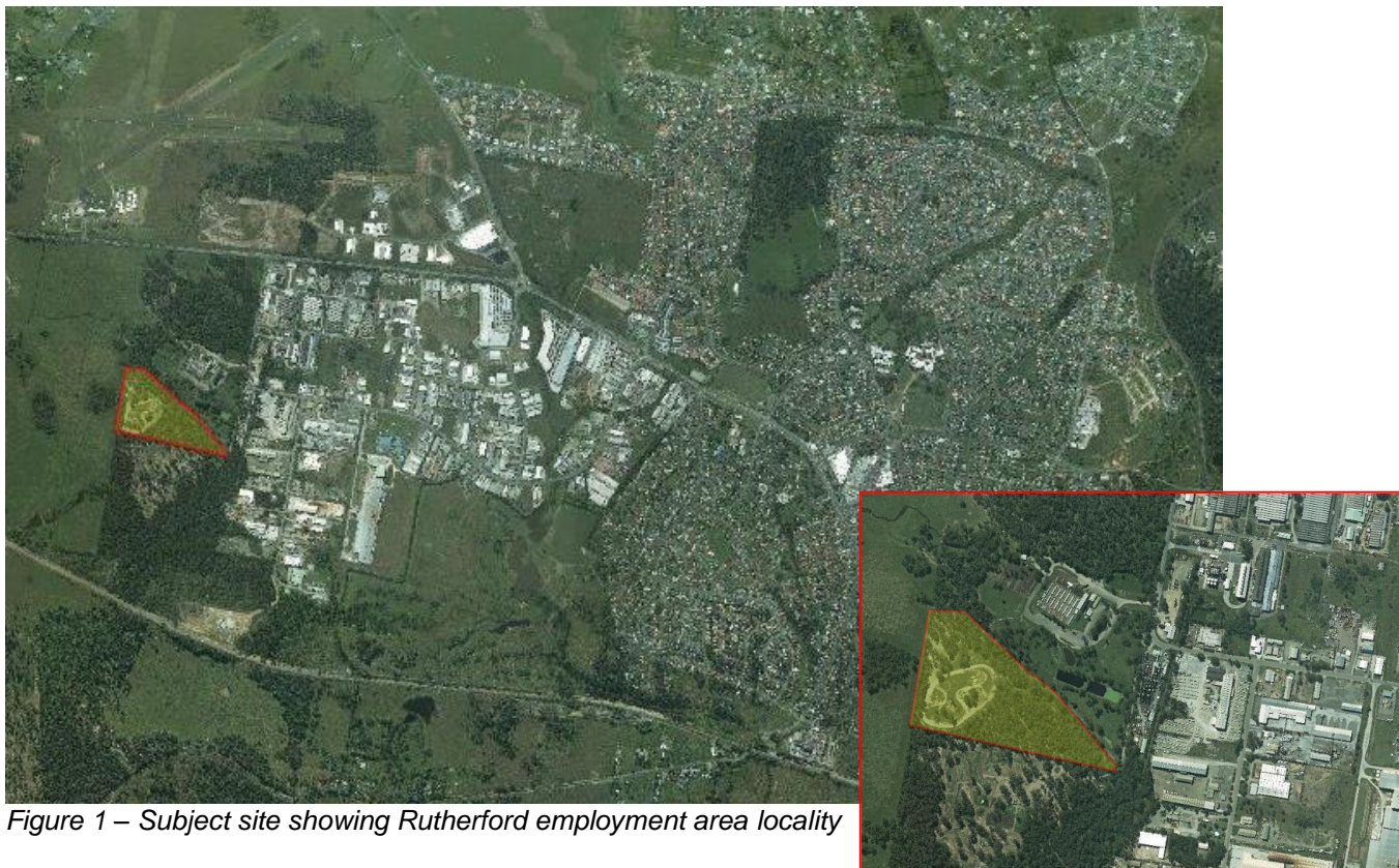
Figure 1 – Subject site showing Rutherford employment area locality

The site is currently zoned E3 Environmental Management.